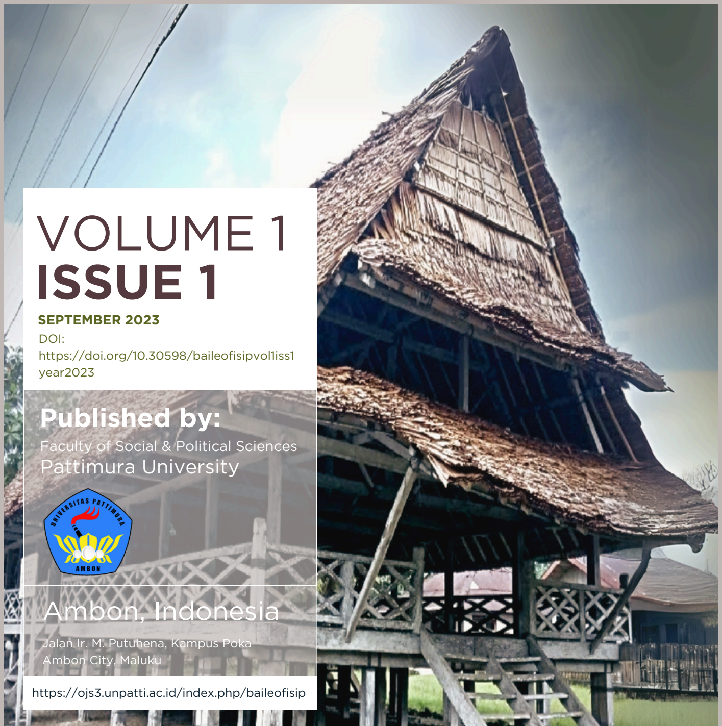
Images: Baileo, traditional Maluku house

https://ojs3.unpatti.ac.id/index.php/baileofisip