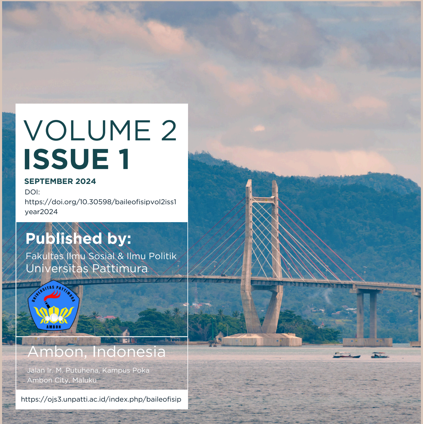
Images: Merah Putih Bridge, Teluk Ambon

https://ojs3.unpatti.ac.id/index.php/baileofisip