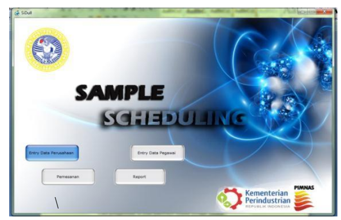
Figure 2. The First Appearance of Si Dull

The application made by using the ACO algorithm to solve the sampling route of the Industrial Research and Standardization Center of Surabaya. This is an application to find the shortest route within resource limitations that has a sampling of three operators. Here the Si Dull software is created with the Visual Basic (VB) programming language.