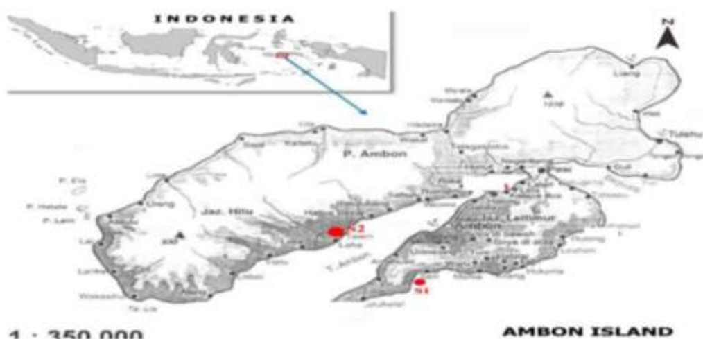
Figure 1. Map of the site location

This research was conducted in an intertidal area from July to August 2020. The research locations were the coastal waters of Seri Village (3045'01 "S 128010'04" E) and Tawiri Village (3039'31 "S 128012'33" E) (Figure 1 Determination of the research location based on purposive sampling technique with the following criteria: 1) Consideration of oceanographic conditions (environmental factors), 2) the type of substrate where the organism is located, and 3) the ease (accessibility) factor in sampling.