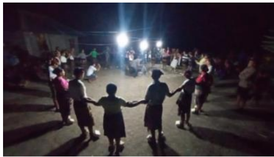
Figure 2. D'oa pedattu

D'oa pedattu is the first stage in the Ped'oa traditional dance. D'oa pedattu is the first stage in the Ped'oa traditional dance. At the beginning of the Ped'oa traditional dance, the mone pedjoe will sing the verses of the song so that all the dancers will form a circular formation and hold hands on the elbows to start the dance. In d'oa pedattu, mone pedjoe will step the right foot forward once and followed by the left foot swung forward and immediately pulled back and the right foot pulled back.