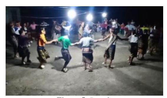
Figure 5. Pegede

Pegede is the last stage of the Ped'oa traditional dance. After the d'oa leo dai is finished, the mone pedjoe will chant verses of the songs to start pegede. The movement in the pegede is swinging the right and left legs forward once each.