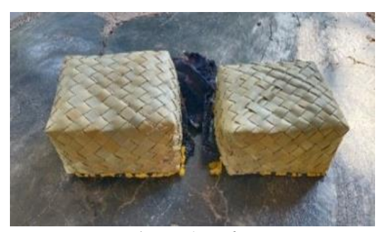
Figure 6. Ked'ue

Mone pedjoe is the leader of the Ped'oa traditional dance who sings verses of songs to accompany the dancers of the Ped'oa traditional dance dancers. In addition, dancers in performing dance use ked'ue which is tied to the instep as an additional accompaniment in Ped'oa traditional dance. All dancers of the Ped'oa traditional dance will use one pair of ked'ue each one for the right foot and left foot.