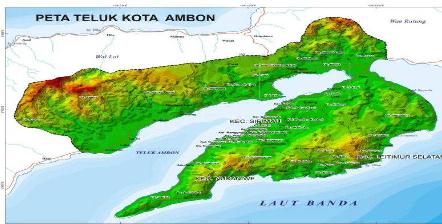
Figure 1. Location of Sponge Sample at Ambon Bay.