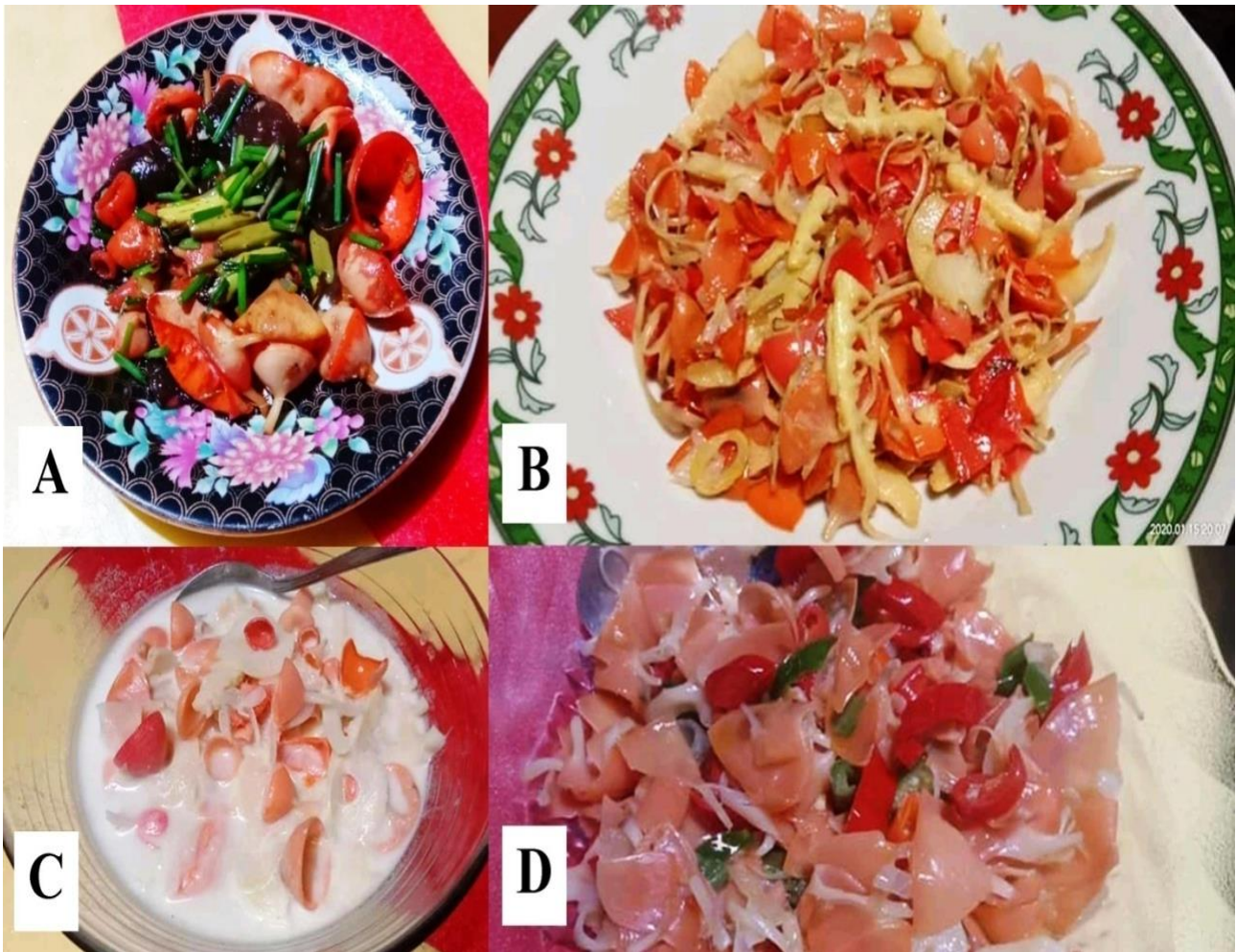
Figure 4. Culinary preparations of edible wild Cookeina by the Dayak Maanyan indigenous community. A: Stir-fried dish with chives. B: Stir-fried dish with grated coconut. C: Soup dish with coconut milk. D: Stir-fried dish with tomatoes.