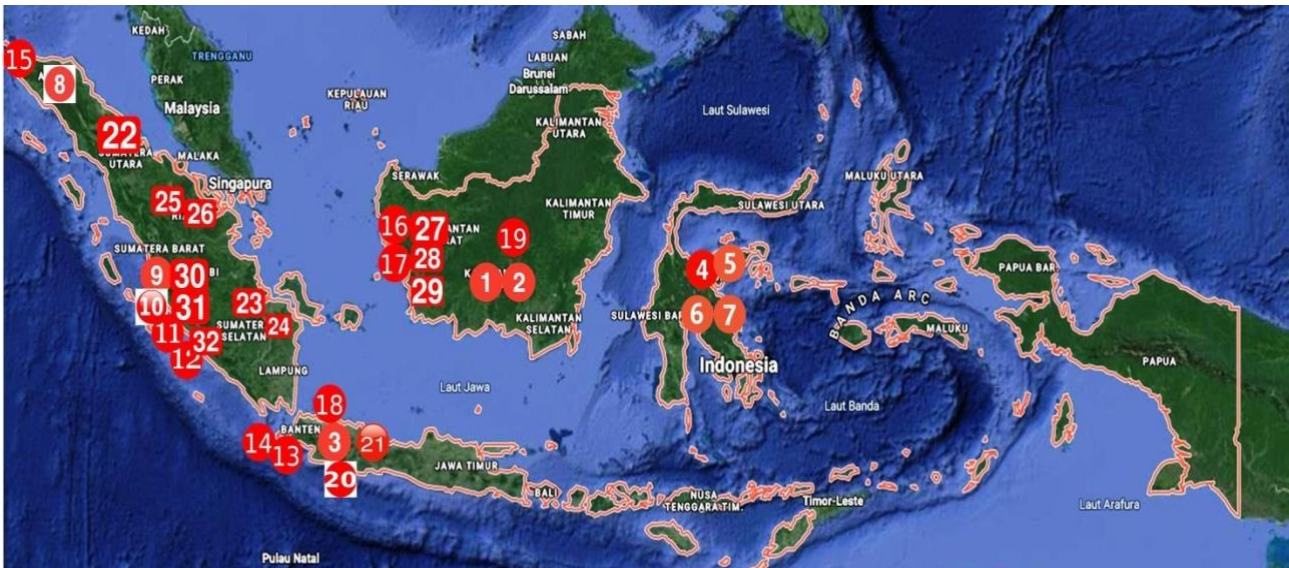
Figure 2. Infographic of Cookeina Distribution in Indonesia (numbers correspond to information in Table 1).