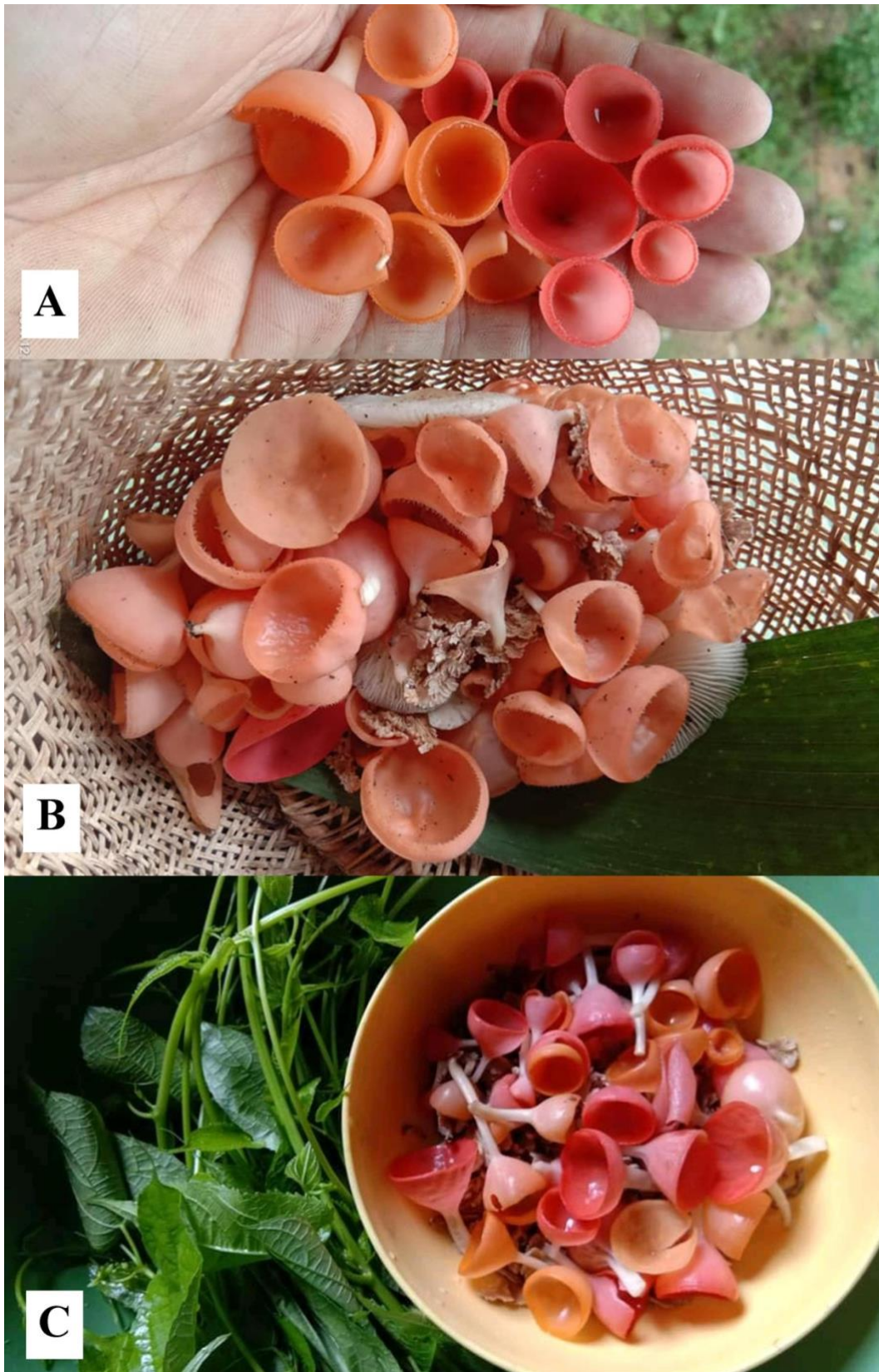
Figure 3. A: Ascomata of C. speciosa and C. sulcipes collected directly by hand. B: Fruit bodies collected together with other fungi and placed in a woven basket container. C: Fruit bodies collected are washed thoroughly along with the 'pohpohan' plant.