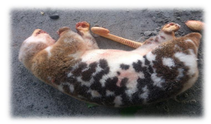
Figure 3. Kusu potar caught in a mangrove community in Ihamahu

death of mangroves. The waves that hit the talud with high strength will wash away the silt so that it disturbs the life of mangrove plants.