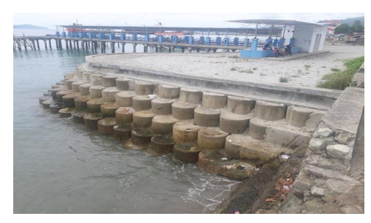
Figure 4. Construction of talud and jetty accelerated mangrove extinction

Hunting is also carried out in large numbers for Tupepel or tortoise ( Coura amboinensis ) for meat consumption, especially by ethnic Chinese. It is believed to increase the endurance of the body and the heart's ability. The arrests are usually carried out at night using petromax lights to lure these animals out. Catching can be done directly by hand because the motion is slow. Coura amboinensis is an aquatic animal that lives in river estuaries or puddles in mangrove communities. The animals that are caught will be kept for about 14 days to naturally remove the mud in their stomachs through the faeces, then cut them for consumption.