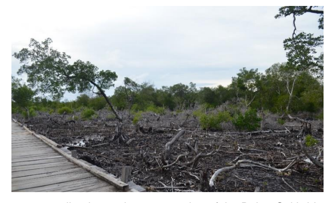
Figure 6. Mangrove mortality due to the construction of the Pulau Osi bridge in Kotania Bay

This is in line with Silver (1997), who states that the primary key to developing this potential is a database with adequate information on ecotourism opportunities and effective ways to disseminate information to "potential tourists".