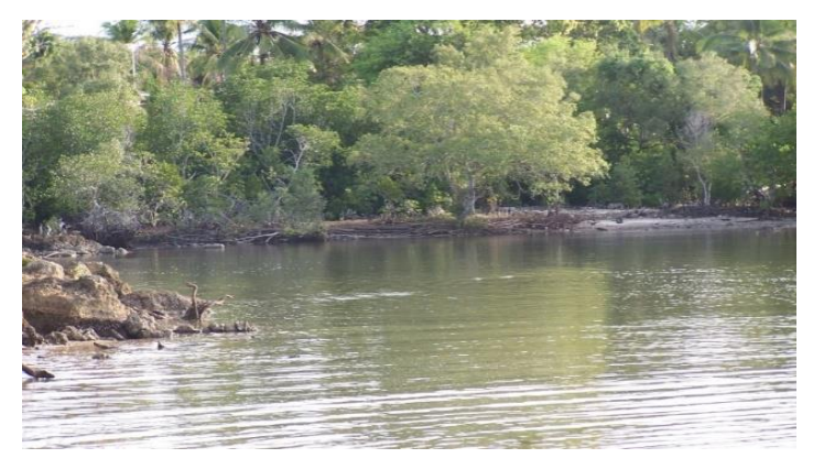
Figure 5. Damage in mangrove communities due to abrasion in Haria village

Hunting is also carried out in large numbers for Tupepel or tortoise ( Coura amboinensis ) for meat consumption, especially by ethnic Chinese. It is believed to increase the endurance of the body and the heart's ability. The arrests are usually carried out at night using petromax lights to lure these animals out. Catching can be done directly by hand because the motion is slow. Coura amboinensis is an aquatic animal that lives in river estuaries or puddles in mangrove communities. The animals that are caught will be kept for about 14 days to naturally remove the mud in their stomachs through the faeces, then cut them for consumption.