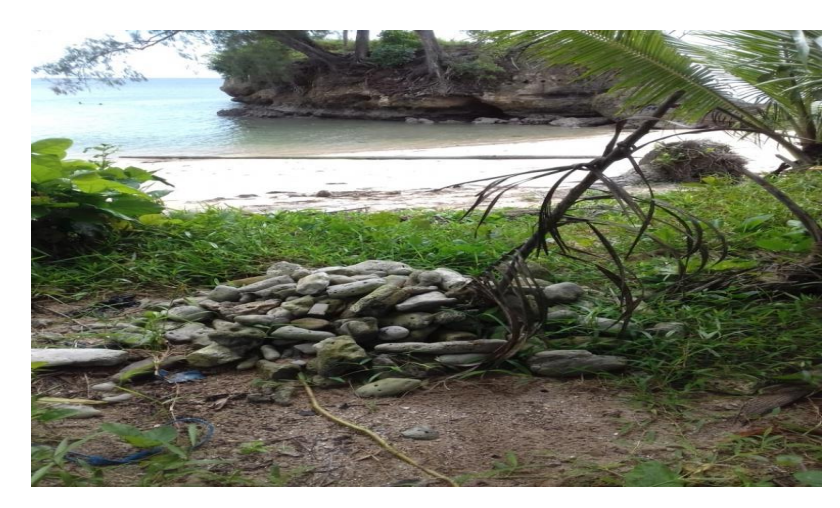
Figure 2. Mining of coral reefs as a destroyer of mangrove ecosystems